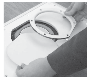
Painting Mask Placement

The PowerPlane 1.2 is shipped with an off-white finish, but can be painted any desired color. To protect the driver during painting, first remove the grille and then remove the driver trim ring by removing the six ring mounting screws. Place the included paper painting mask over the driver, then place the trim ring on top of the mask.