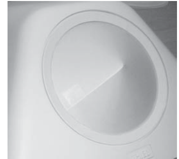
Painting mask installed

The PowerPoint 1.2 is shipped with an off-white finish. The speaker can be painted any desired color. To paint the speaker, first remove the grille and insert the included painting mask to protect the driver. The rim of the mask is tucked between the black rubber woofer surround and the white plastic rim of the cabinet's driver opening. Also, peel the cloth from the back of the grille before painting its front surface. After the paint is dry, reinstall the grille's rear cloth and the grille onto the cabinet.