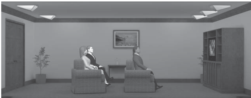
5-channel ceiling-mount installation

The PowerPoint 1.2 can be placed in a wide variety of locations throughout the room on ceilings and walls. The speaker's wedge shaped cabinet and coaxial driver mounting allow the PowerPoint 1.2 to optimize the coverage area for a variety of speaker placements and listener positions.