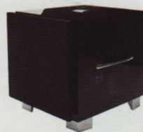
REL Acoustics S/5 SHO