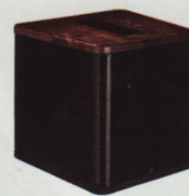
MartinLogan BalancedForce 210