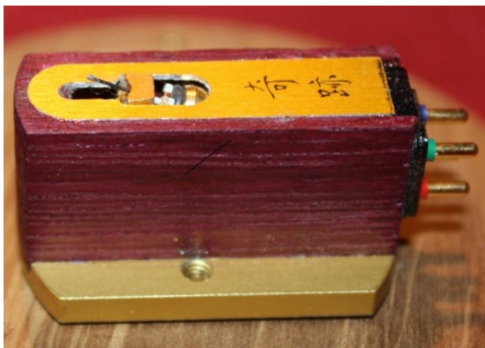
Kiseki Purpleheart N.O.S.

Here she is again! The Kiseki! I lost track of her 20 years ago and now we meet again, but while I am older and fatter, she's exactly the way she was.