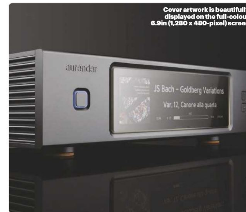
Cover artwork is beautifully displayed on the full-colour 6.9in (1,280 x 480-pixel) screen

Aurender Inc and Melco are largely responsible for establishing the ‘NAS niche’ for audiophiles. Digital output-only music libraries now include the £1,500 Roon Nucleus + (HFC 439), the £4,600 Auralic Aries G2.1 (HFC 469), plus the very high-end £9,495 MU1 from Grimm Audio. Two-box solutions with specialised outboard PSUs include the £9,000 N10/2-S38 (HFC 488) from Melco and £11,400 Statement from Innuos. These audio-specific storage/server solutions are worth investigating if you've already invested in a top-flight USB or S/PDIF-connected outboard DAC.